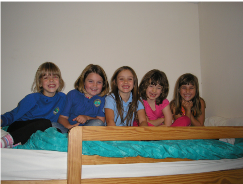
Working together and strengthening friendships at Birdoswald.