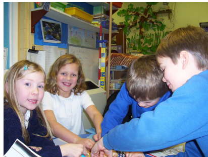
Sharing ideas, listening to each other, taking turns and working together.

Where children have good skills in these areas they will be motivated to, and equipped to: