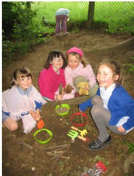
Sharing our learning, having fun together, and being successful.

http://www.teachernet.gov.uk/teachingandlearning/socialandpastoral/seal_learning/